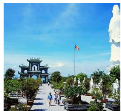
Linh Ung pagoda