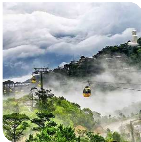
Ba Na Hills Cable Car